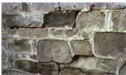
The results of too-hard mortar can be spalling of soft, pre-1860s brick (top) and some soft stones such as rubble fieldstones (bottom).